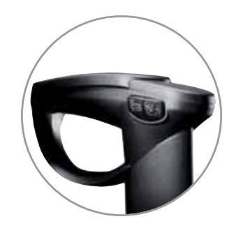
Optional Loop Arm (NL) Black Nylon, with push buttons and soft urethane arm pad.